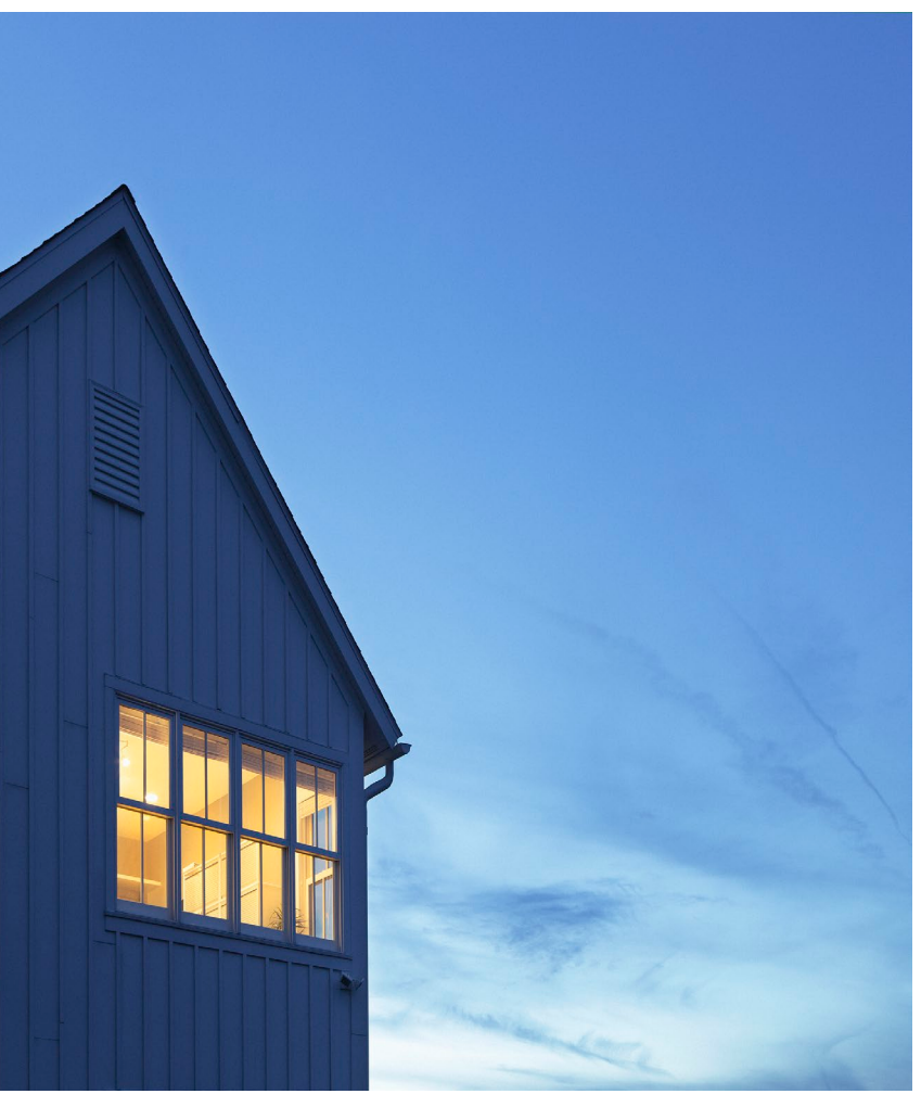
4 | Regulator of Social Housing | October 2024