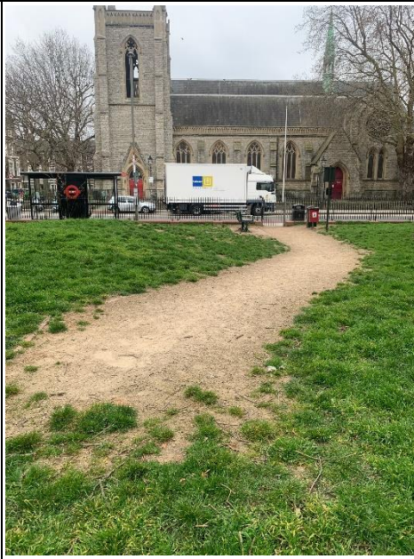
Path across green