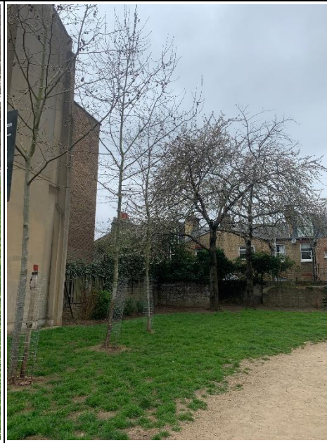
Path and boundary to SW