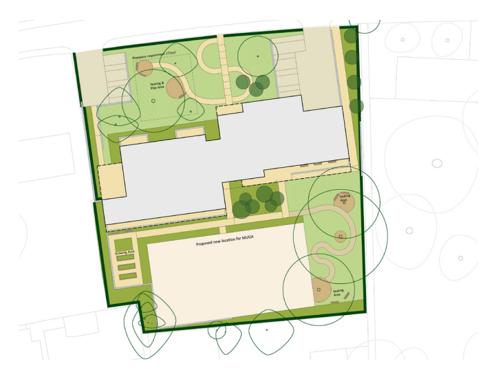
Proposed Ashburton Youth Centre Landscaping

The proposed landscaping approach has carefully considered and responded to the site context and will