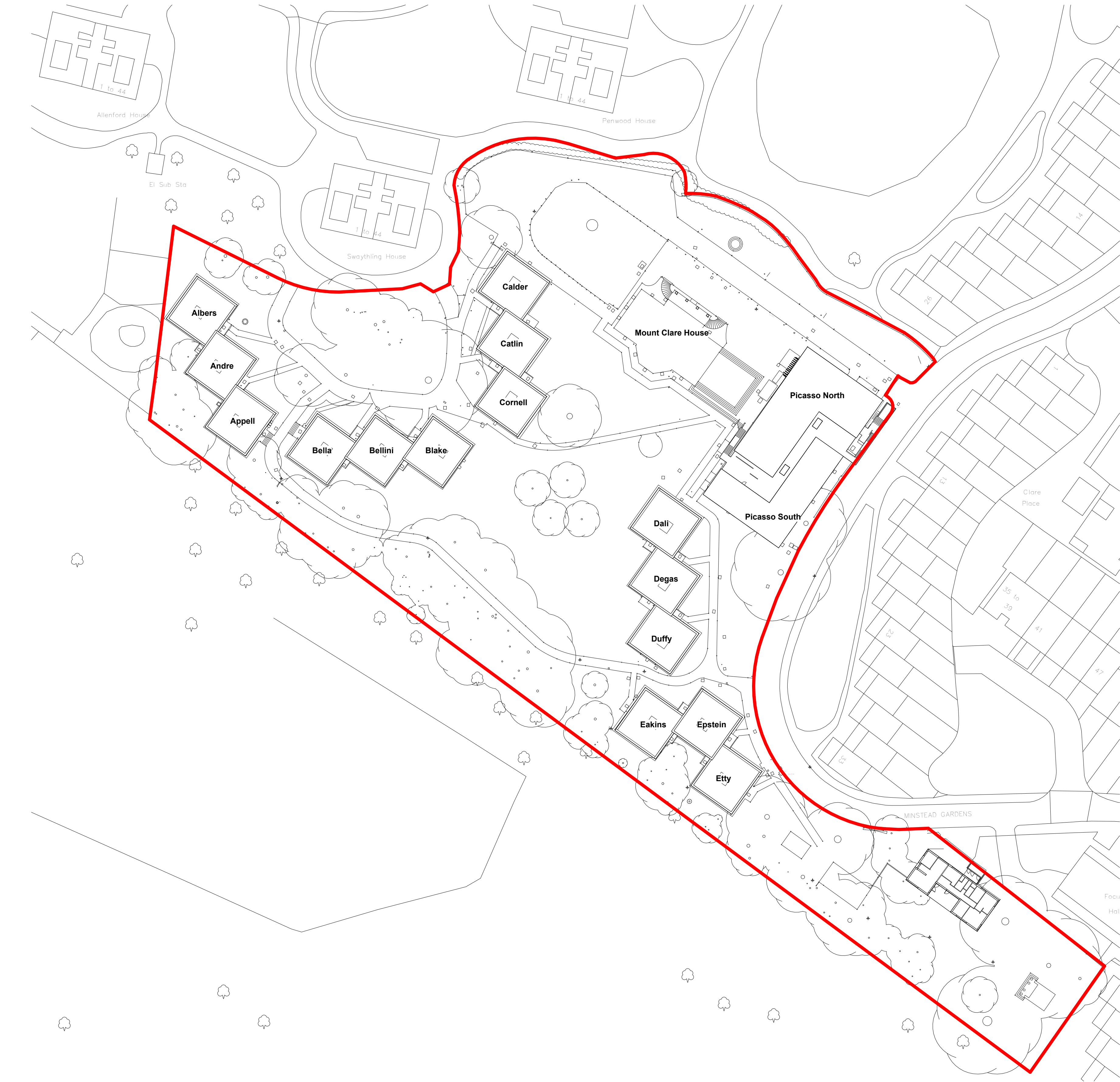
1 Proposed Site Plan 1 : 500

General Notes This drawing is copyright of KSR architects. This drawing must be read in conjunction with the Designer's Risk Assessment, specification and all other relevant documentation and drawings. KSR architects accept no liability for any expense, loss or damage of whatever nature and however arising from any variation made to this drawing or in the execution of the work to which it relates which has not been referred to them and their approval obtained. Areas are based on unchecked survey and are approximate only. Do not scale from this drawing or the digital data, only figured dimensions are to be used. Refer to linear scale for guidance. Check all dimensions on site prior to carrying out any works and advise any discrepancy