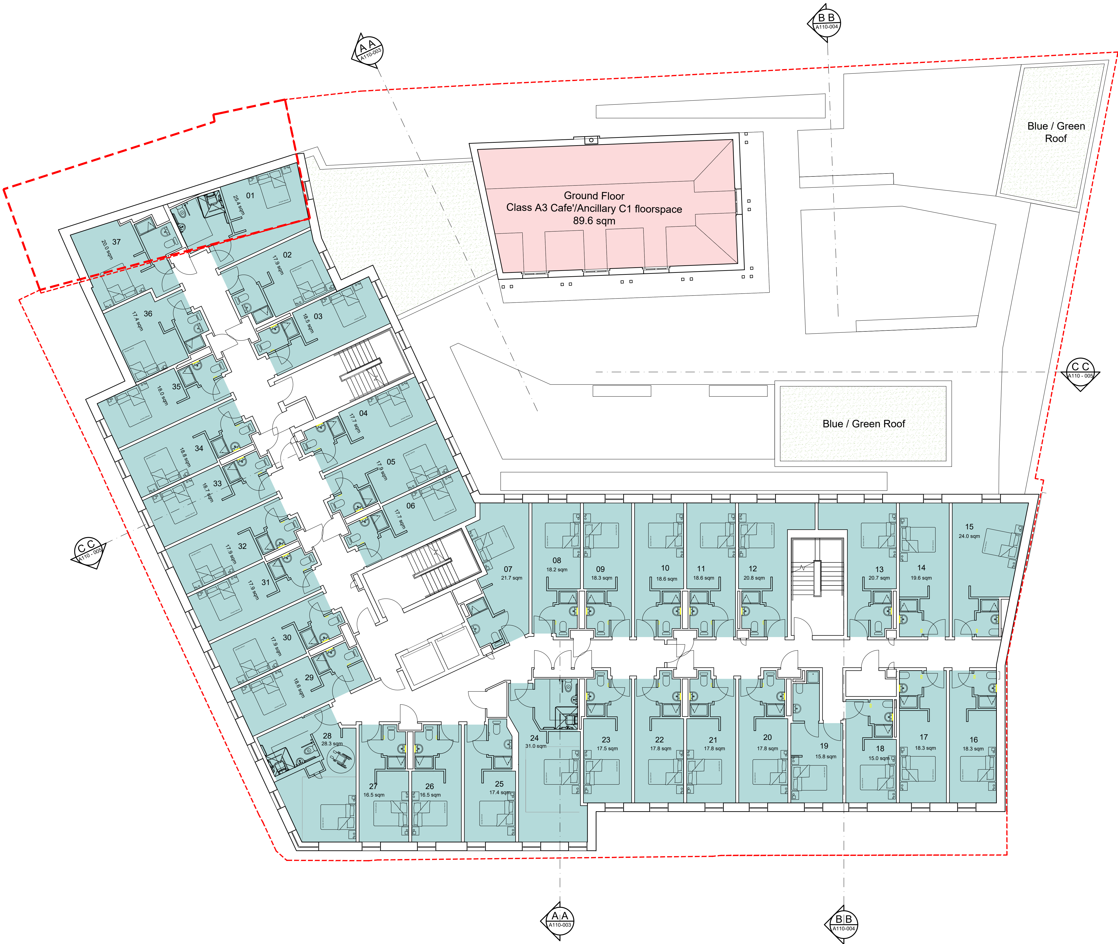
PROPOSED LEVEL 1 FLOOR PLANS SCALE: 1:100 @ A1