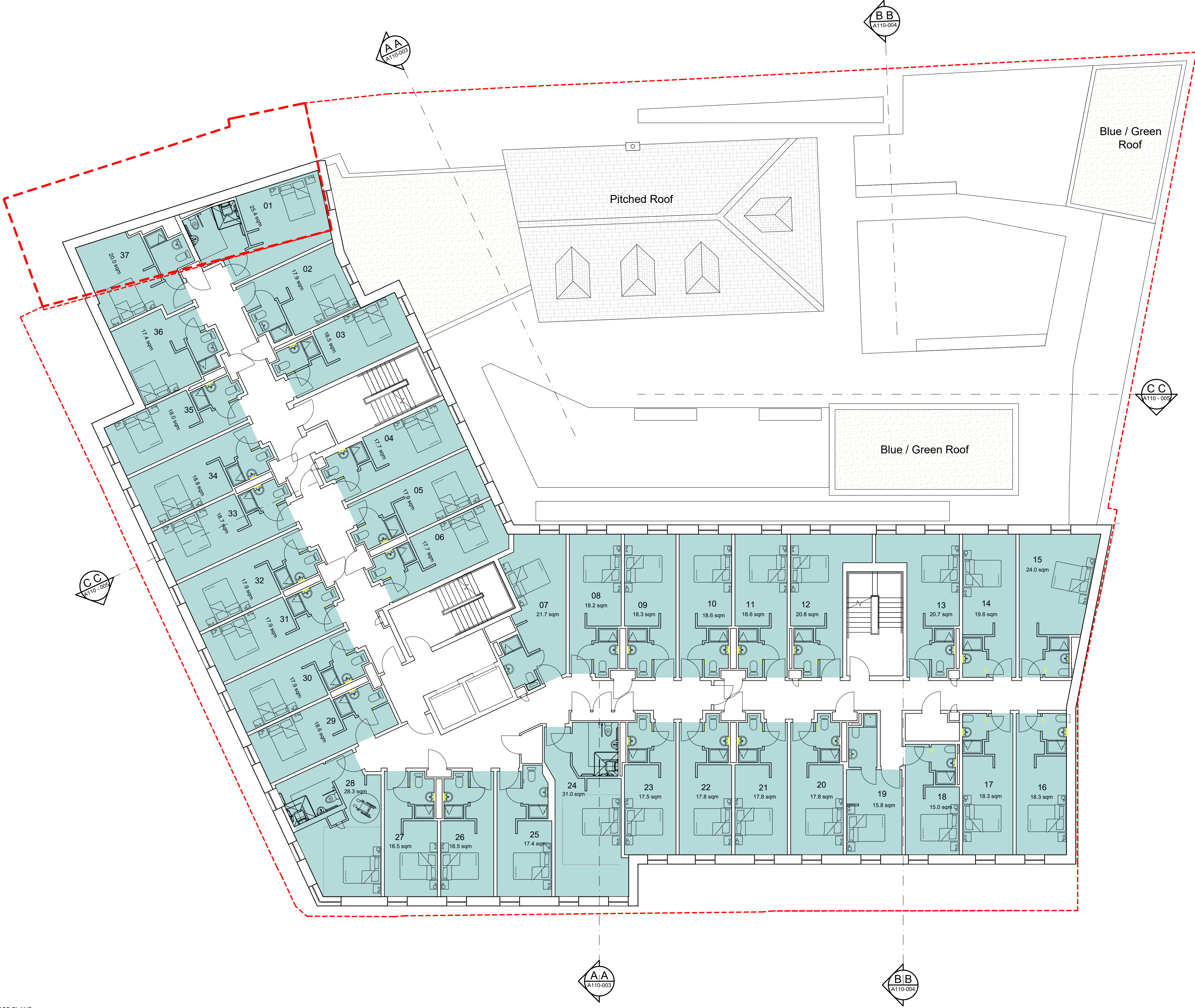
PROPOSED LEVEL 2 FLOOR PLANS SCALE: 1:100 @ A1