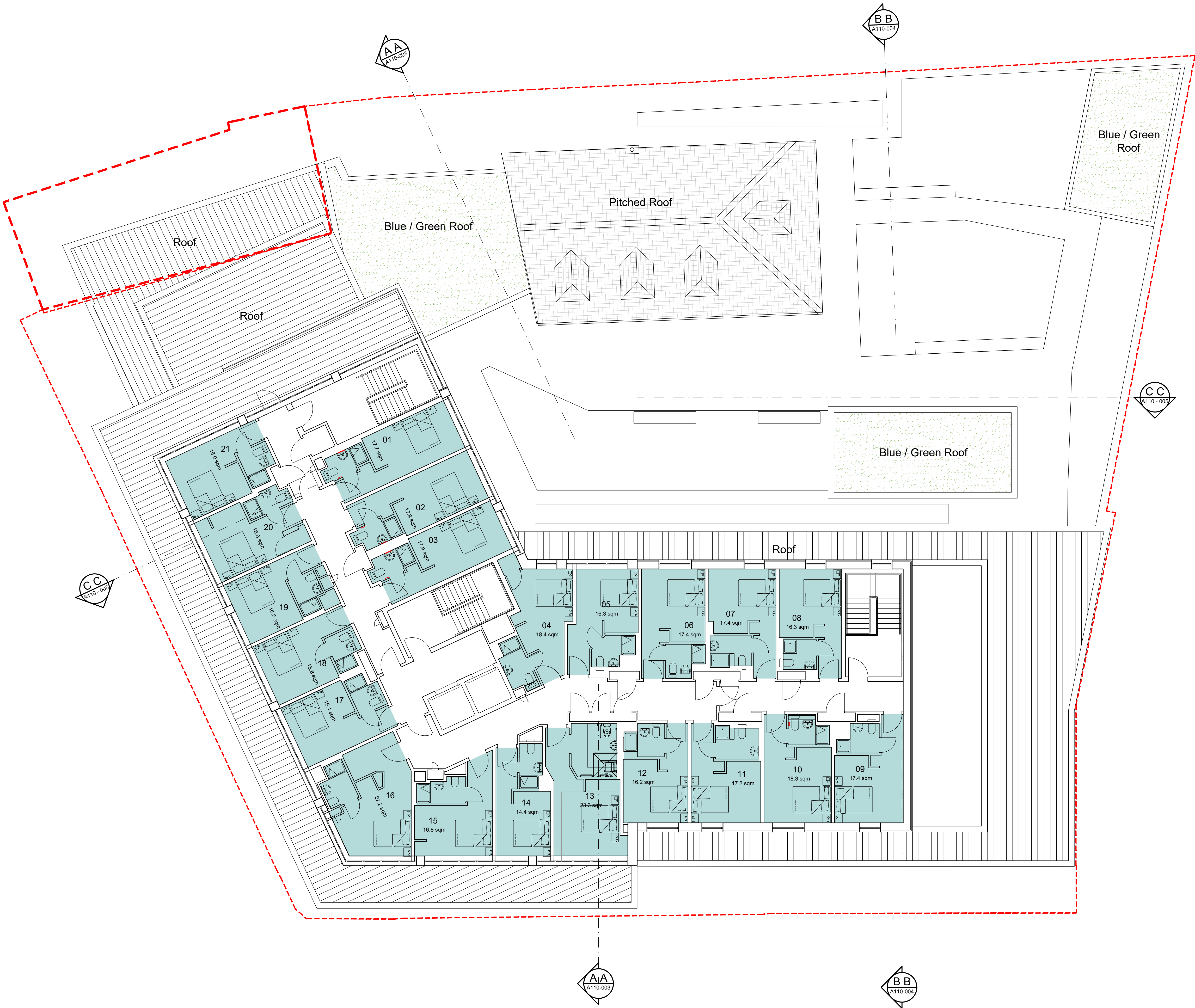
PROPOSED LEVEL 5 FLOOR PLANS SCALE: 1:100 @ A1