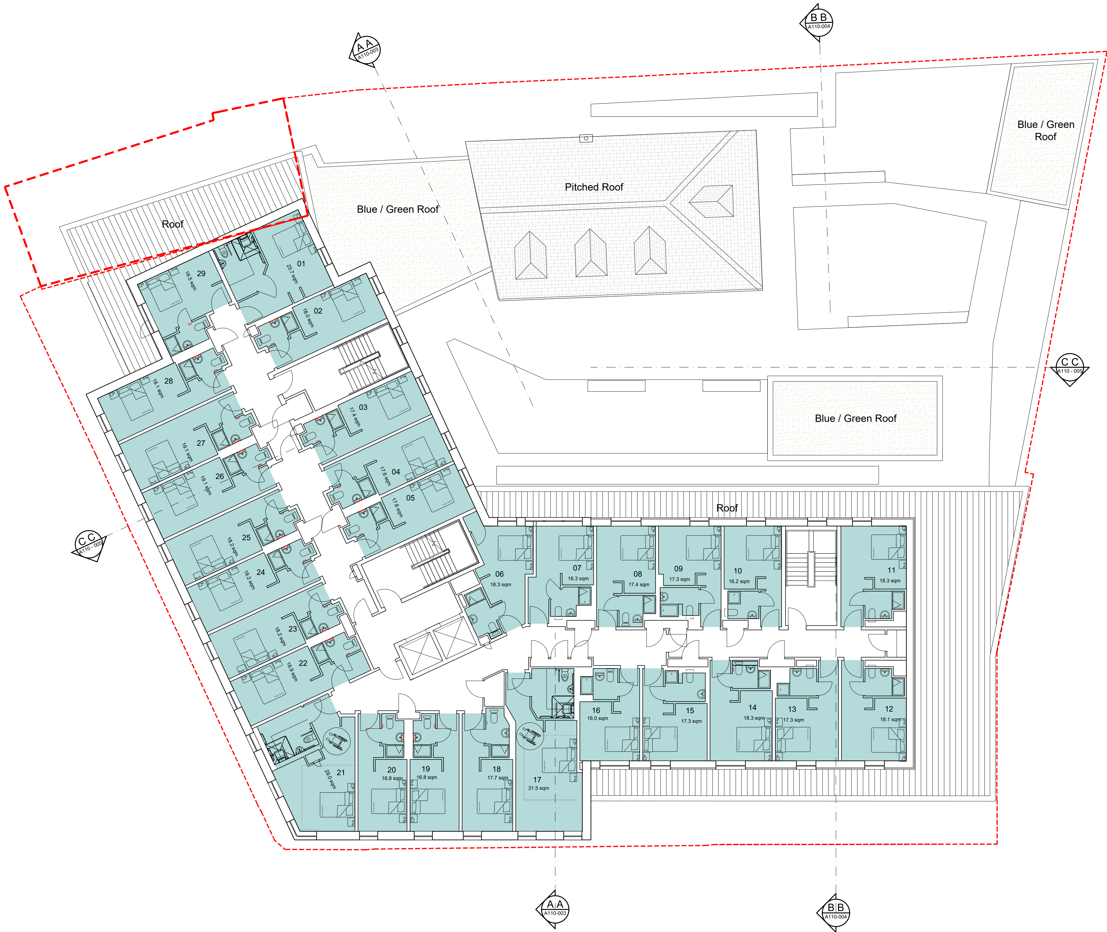
PROPOSED LEVEL 4 FLOOR PLANS SCALE: 1:100 @ A1