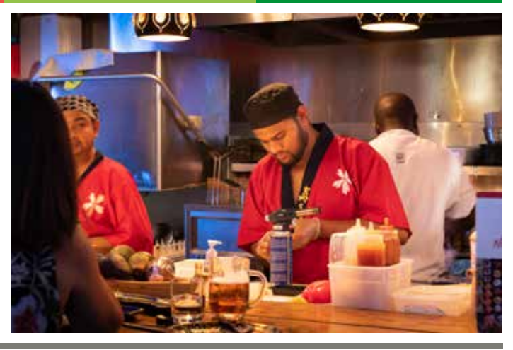
Sign up for e-news wandsworth.gov.uk/e-news 19

Read it at.wandsworth.gov.uk/night-time-strategy