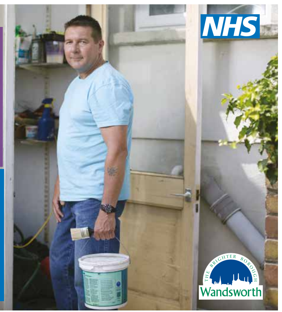
Sign up for e-news wandsworth.gov.uk/e-news 5

Helping you prevent diabetes heart disease kidney disease stroke & dementia