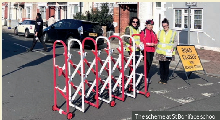
The scheme at St Boniface school

Find out more at wandsworth.gov.uk/school-streets-scheme