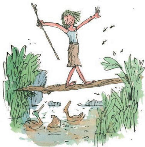
© Quentin Blake 2023. All rights reserved.